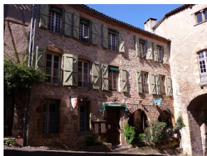
L'Escuelle des chevaliers in Cordes sur Ciel – B&B - www.lescuelledeschevaliers.fr