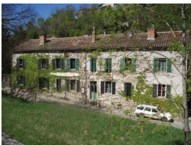
l'abri-niquel in Bruniquel B&B www.abriniquel.blogspot.com