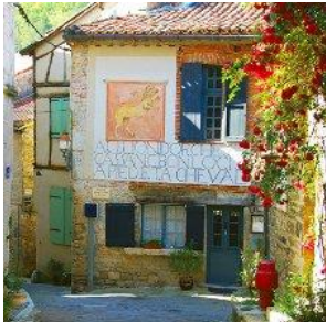
L'auberge du Lion d'or in Saint Antonin Noble Val – B&B www.aubergeliondor.fr