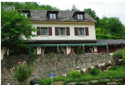
Hôtel Belle Rive in Najac – hotel/restaurant - www.le-belle-rive.fr